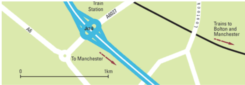
Bolton Arena plan