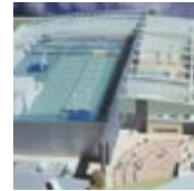
Table Tennis Centre, Sportcity

This new facility will provide six indoor tennis courts in two large halls, each housing three courts. The facility provides an excellent venue for table tennis with one of the halls accommodating the four showcourts and the majority of the spectator seating. The other holds up to six competition tables and a number of warm up/practice tables.